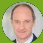
Dr. Roland Busch Member of the Managing Board of Siemens AG